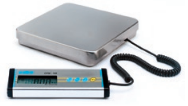
Hard Carrying Case for HB-4775 Scale—HB-4775C

Compact and portable, this scale has a capacity of 165 lb (75kg) and a readability of .05lb (.02kg). Pan size is 12.25" x 12" (310 x 300mm). Can be used with AC or batteries and a great, hard carrying case is available.